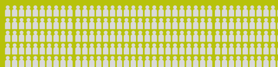
*Each figure = 10 people who are detained