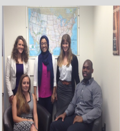
UNHCR U.S. Protection Unit Individual Case Management Services

The U.S. Protection Unit of the United Nations High Commissioner for Refugees (UNHCR) Regional Office in Washington, DC receives individual inquiries via phone, letters, and emails from detained and non-detained persons who are applying for asylum or other forms of protection within the United States. Although UNHCR does not provide legal advice or legal representation, the U.S. Protection Unit can provide information to help asylum seekers prepare their cases and referrals to local legal organizations that may be able to represent them.